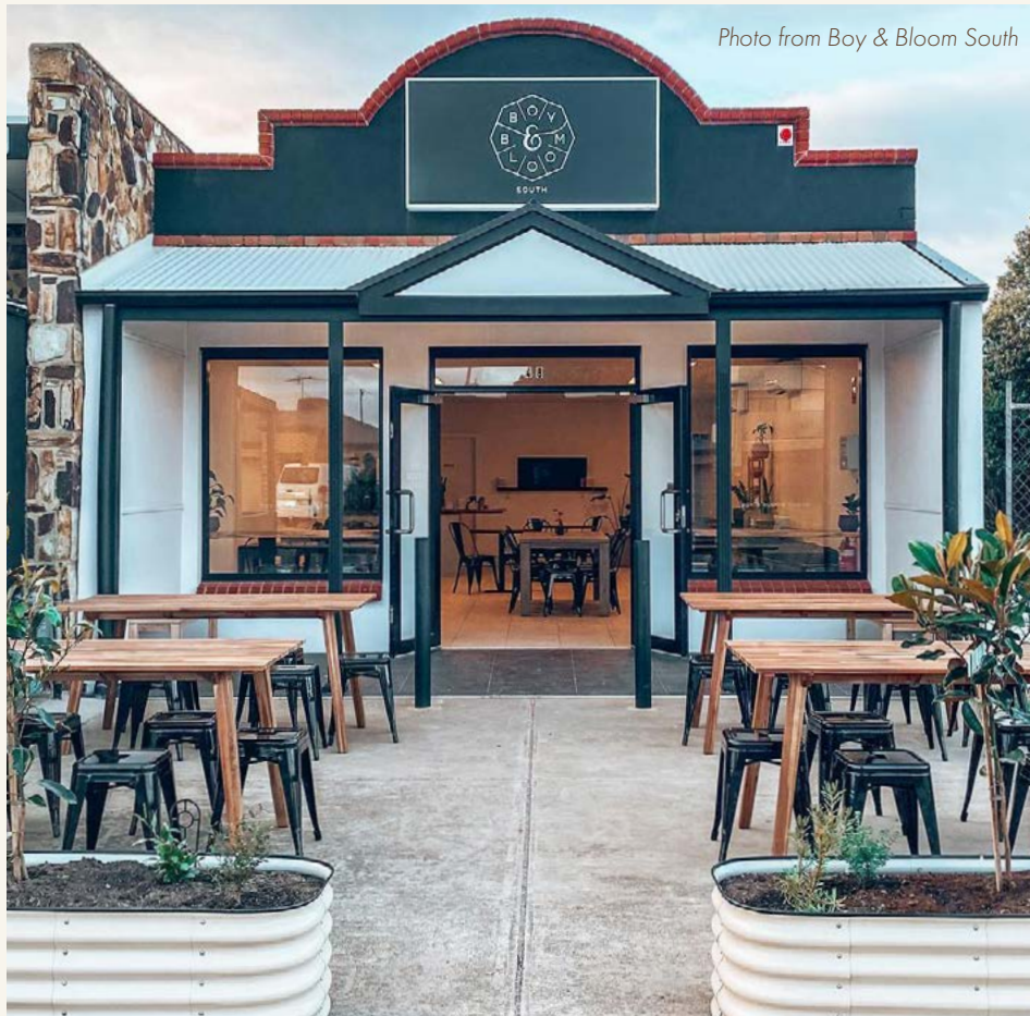
Photo from Boy & Bloom South